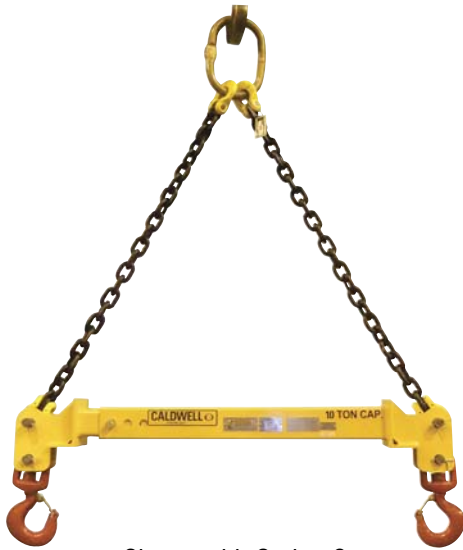
Shown with Option C